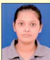
Itika 5th Position B.Voc. RM 1st Sem.